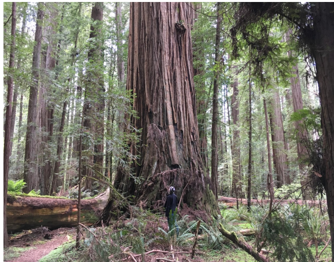
California coastal redwood trip 2018.